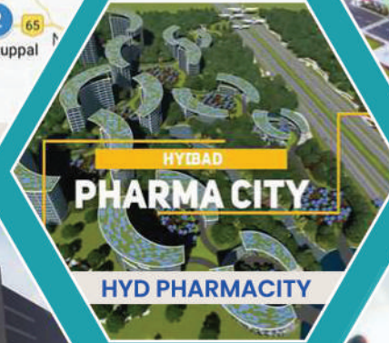
HYDABAD PHARMA CITY