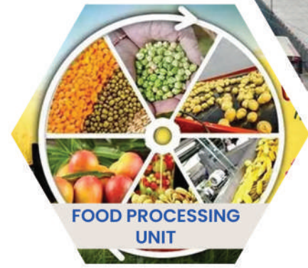
FOOD PROCESSING UNIT