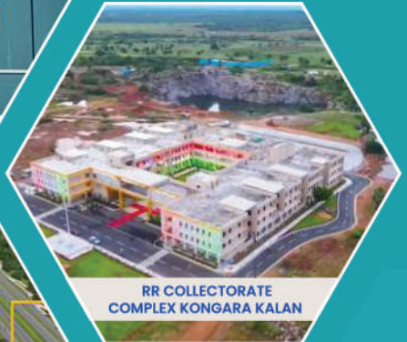
RR COLLECTORATE COMPLEX KONGARA KALAN