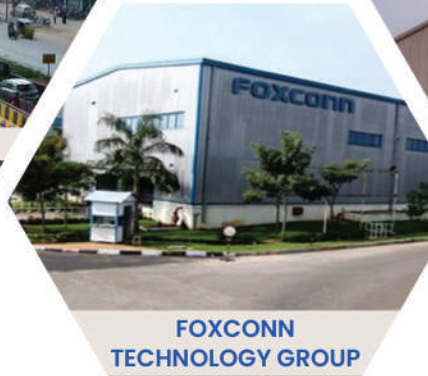
FOXCONN TECHNOLOGY GROUP